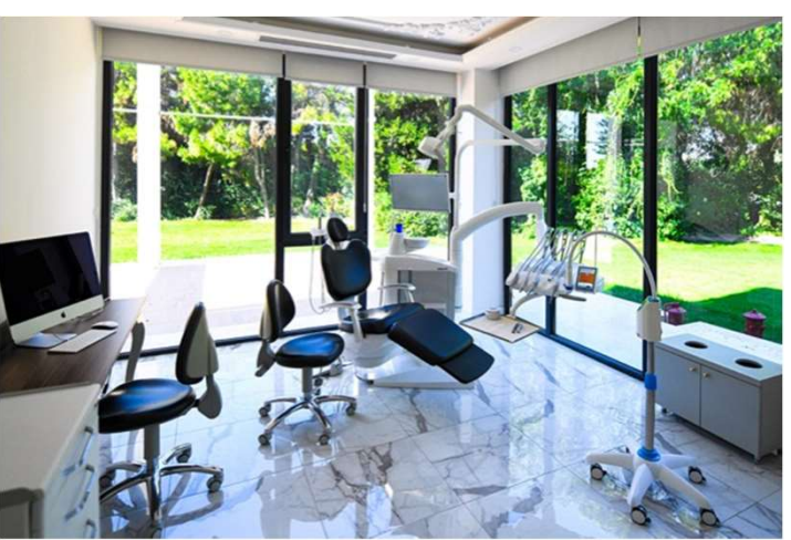
• Health packages exclusively prepared for our guests