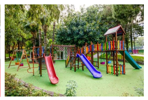
With the Rixy Kids Club playground, your children will have fun with nature and discover their talents. Babysitting services are not offered.