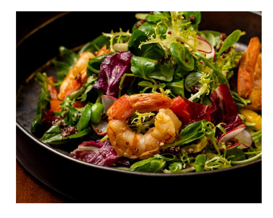
Terrace A'la Carte